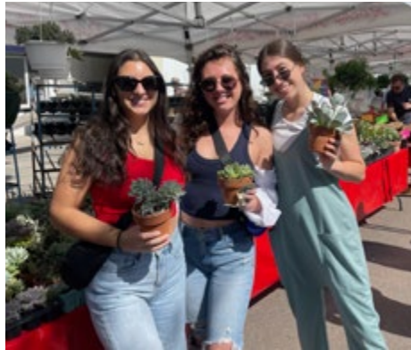
SCENES FROM FARMERS MARKET